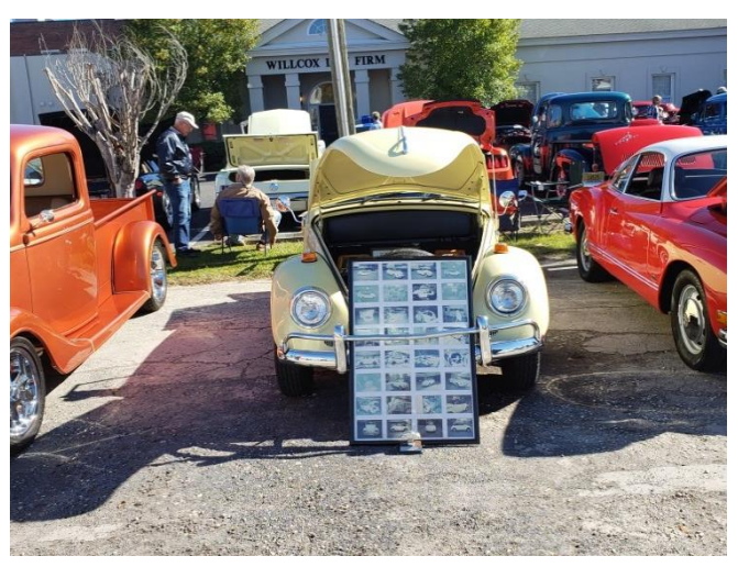
Best Non-Production Award