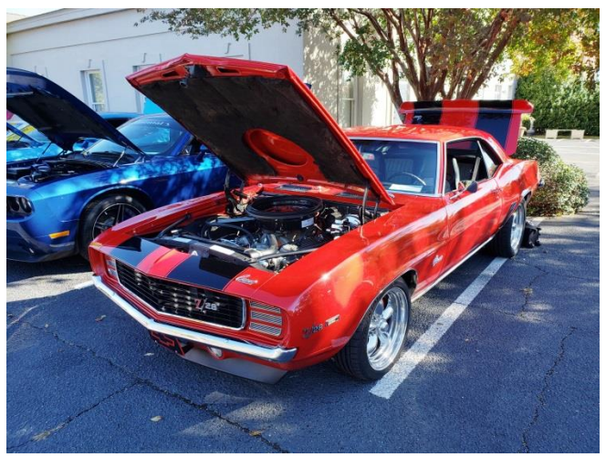
Best Production Award