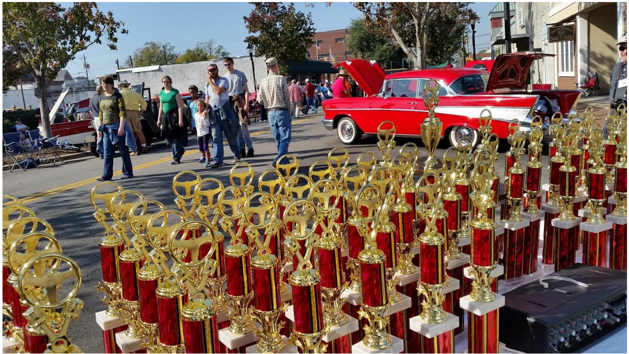
Trophy Talk.... "Somewhere out there is a car for me"