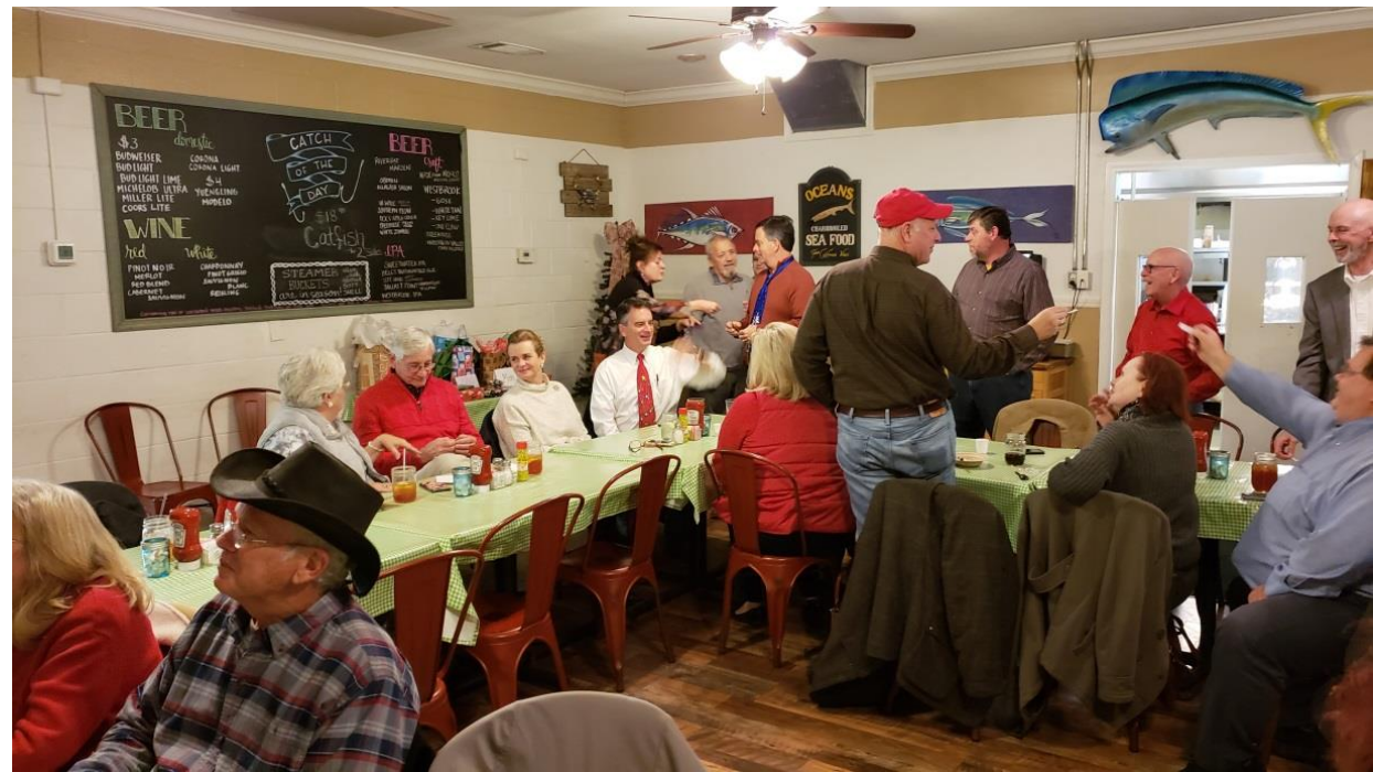
I am, I am !!!