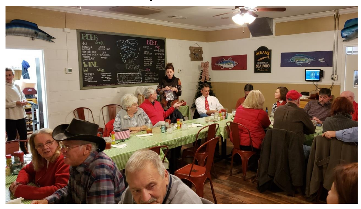
Who is Lucky #1?