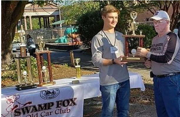
Best Non Production Award