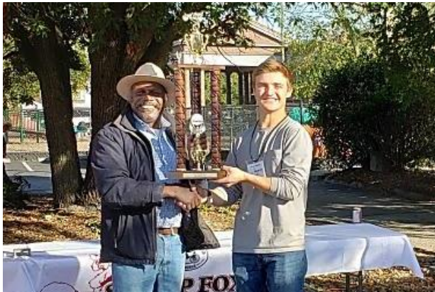
Best Production Award