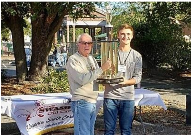
Mayors Choice Award