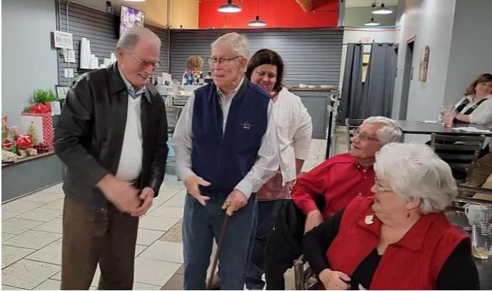
Meeting Adjourned...Dinner Time.