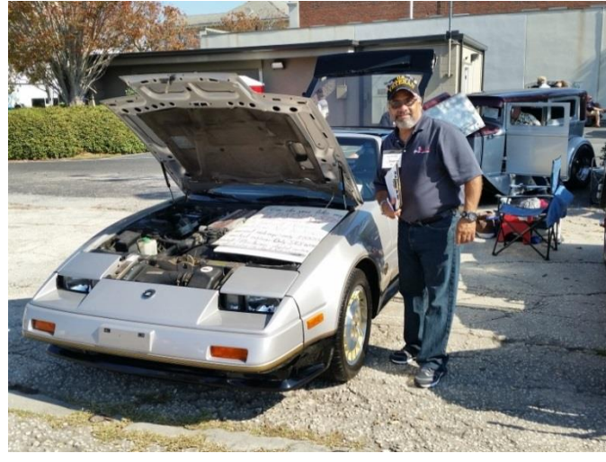
And The Winners are....