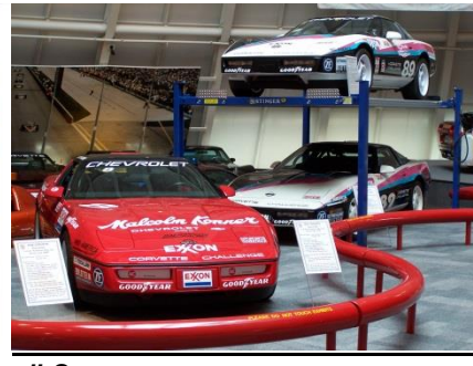
1989 Corvette Challenge Race Car # 8

In 1989, the SCCA sanctioned Corvette Challenge race series continued for its second and final year. The (12) Corvette Challenge races were run in conjunction with various Trans Am, NASCAR, and Cart Indy Car races.