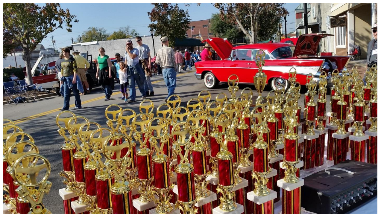
Trophy Talk.... "Somewhere out there is a car for me"