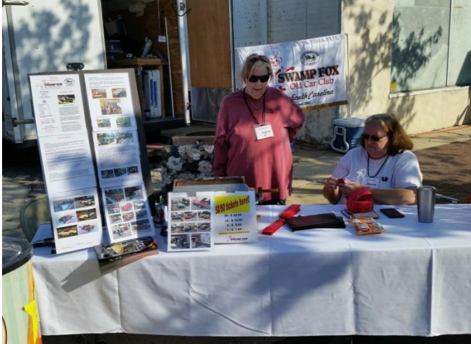
Let the judging begin.